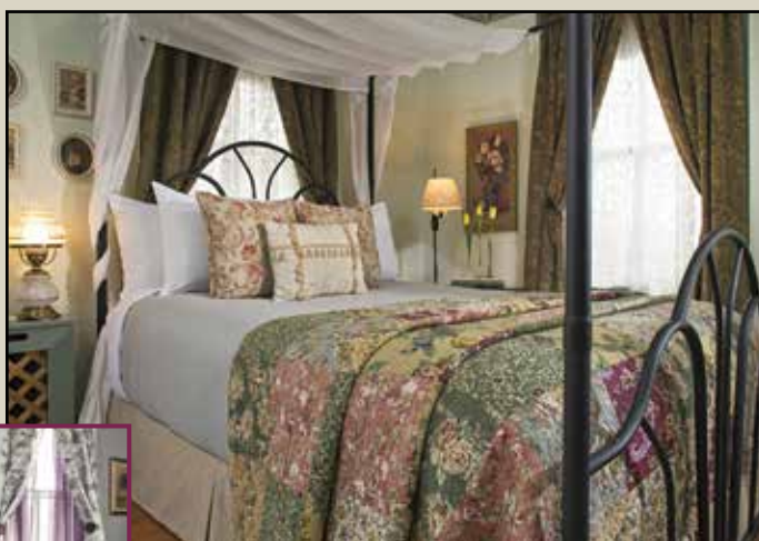
< Rose Queen Room