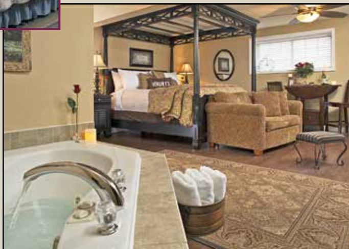
Hershey Sweet Cottage

The warmth and charm of a 19th-century farmhouse with 21st-century comfort and conveniences. The 1825 Inn offers six rooms upstairs in the main house: 3 have king beds (one can be configured as two twins) and 3 have queen beds. And for an even more private getaway, 2 cozy cottages await out back in our beautifully-landscaped grounds.