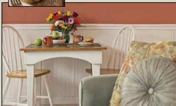
... or have breakfast served in your Cottage.

You may want to extend your stay ... just to sample more of Don’s delectable daybreak delights! Rave reviews!