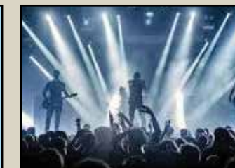
Concerts & Theater