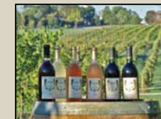
Antiques & Wineries