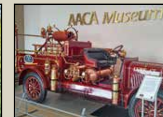
Museums & Tours

Be blown away by the roller coasters at Hersheypark, the antique & classic cars at the AACA Museum, a trolley tour of Hershey’s history, or a spin through Chocolate World. Sweet Rides! Enjoy top-notch entertainment of all genres at the Giant Center, Hersheypark Stadium, Hershey Theater, or Mt. Gretna Playhouse. Bravo! Encore! Take in Hershey Bears ice hockey or championship high school sports. We’re #1! Please your palate from a plentiful palette of dining options, from casual to fine to farm-fresh ice cream. Yummm. Take a short drive to another world ... Amish Country! Go (but not too far) in search of that perfect antique or taste the best of Pennsylvania’s vineyards. Shop ‘til you drop! Take a chance at the Hollywood Casino or Penn National Race Course. We have a winner! Stroll beautiful Hershey Gardens, check out Hershey Outfitters for an outdoor adventure, visit Indian Echo Caverns, the PA Renaissance Faire, ZooAmerica ... So much to do. So little time!