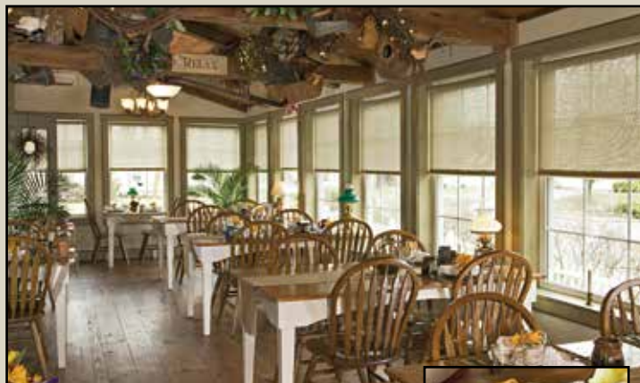
Rise ‘n’ shine in our sunny Breakfast Room ...

A mouthwatering homemade breakfast, featuring fresh fruit, main dish, and all the fixin’s, will jump-start your day!