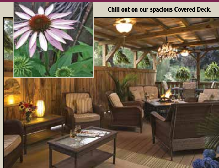
Chill out on our spacious Covered Deck.

Tucked away from the hustle and bustle of modern-day Hershey, the lush, expansive grounds of the 1825 Inn are an oasis of serenity and country living: seasonal flowers, herbs, and vegetables; mature shade-trees and manicured lawns; a two-seater swing and a gazebo hide-away; out-buildings from their farmstead past ... all invite you into this lovingly-maintained, peaceful landscape. Ahhhh.